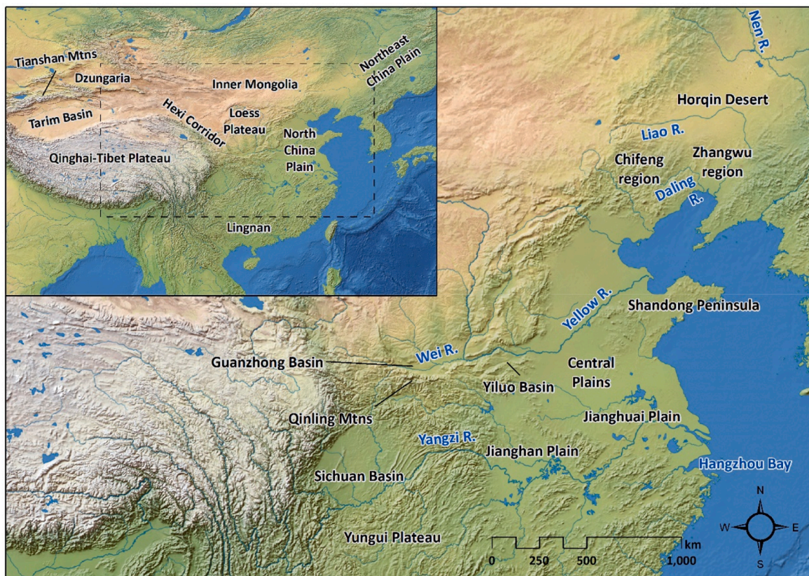
Fig. 1. Major geographic regions and features of continental China, including those mentioned in the text. (Made with Natural Earth. Free vector and raster map data @ naturalearthdata.com.)