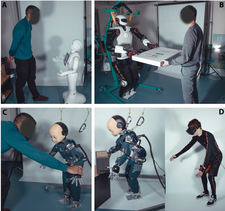
Fig. 1 Examples of human-humanoid interaction and cooperation: A: social interaction with a Pepper; B: cooperative load carrying with a Talos; C: passive physical interaction with an iCub; D: iCub teleoperated by a human operator.

Section 2 we discuss the principal issues in building cognitive and social skills. In Section 3 we formalize the concept of physical human-robot cooperation, while in Section 4 we overview the main interaction control approaches that enable low-level physical interaction between the robot and the human. The knowledge of the human “state” is required by both the high and the low level control to build human-aware control plans: hence we present the main methods used to model and perceive the humans in Section 5. Finally, in Section 6, we report on the current main application of humanoid robots interacting and cooperating with humans: humanoids as personal assistants, co-workers and avatars.