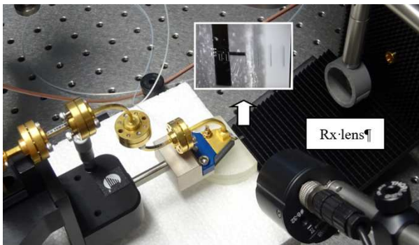
Fig. 1. Setup representation: Waveguide/CPW probe fed Yagi-Uda antenna and short THz link with Rx lens and horn antenna.

To enable the use of Yagi-Uda antenna in a THz link, a single laser-line is modulated using a I/Q Mach-Zehnder modulator (MZM). After combination of the modulated optical signal with a continuous wave laser, an erbium-doped fiber amplifier (EDFA) boosts the signal prior to injection in an untravelling carrier photodiode (UTC-PD) coupled to a 300 GHz CPW probe (Cascade Infinity type [2]). The UTC-PD is a very popular technique that enables optical to 300 GHz band modulated signal conversion among photonics-based techniques [3]. The signal is radiated in free-space by the Yagi-Uda antenna (figure 1). No external lenses to collimate the signal. The THz link is 0.2 m, and the receiver (associated with a 25 mm lens) is integrating a sub-harmonic mixer (GaAs) pumped by a multiplication chain and 30 dB IF amplifier. The IF signal is driving a real-time oscilloscope for I/Q mapping, signal to noise ratio (SNR) or error vector magnitude (EVM) calculation.