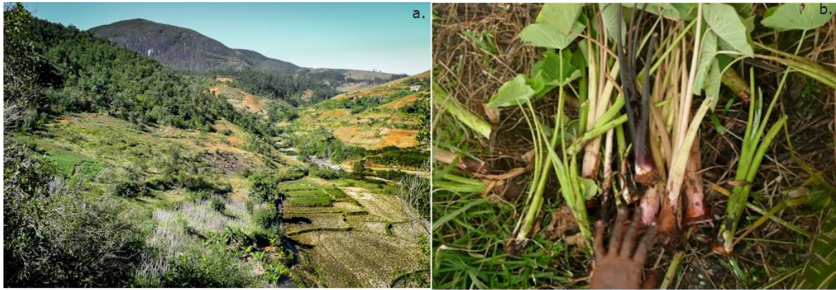
Figure 1. (a) Heterogeneous agricultural landscape on the margins of tropical forests in the southern Highlands, region of the Andringitra massif, Ambohimahamasina, Madagascar (© Stéphanie Carrière, 2012). The diversified agricultural landscapes shaped by smallholder farmers, such as those observed in this region of Madagascar, are home to a rich associated biodiversity that includes insectivorous birds, bats, or pollinators; (b) Exchange of cuttings of a diversity of taro ( Colocasia esculenta ) landraces between women farmers in Wakatr tribe, Ouvea, New Caledonia. (© Vanesse Labeyrie, 2010). Crop diversity is one component of agrobiodiversity playing a key role in smallholder agriculture. Farmers' access to this diversity is strongly conditioned by their social network. For instance, in New-Caledonia, one single farmer can grow dozens of taro landraces she has obtained from a variety of sources, mostly from other farmers, but also from market or extension services.

A substantial literature shows that the structure and composition of social networks play a crucial role in driving the management and governance outcomes for a wide range of natural resources (Barnes et al. 2016; Bodin and Crona 2009). Applying such social networks framework to the field of agrobiodiversity could help develop innovative governance systems for enhancing farmer's access to agrobiodiversity, based on the empowerment of local stakeholders and the collaboration across and within institutional levels (Folke et al. 2005).