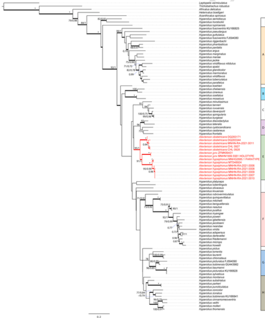
Fig. 3. Maximum Likelihood phylogeny based on 5421 aligned positions of mtDNA (12S: 422bp, 16S: 545bp, ND1: 941bp, ND2: 1,032bp, COI: 1,356bp, Cytb: 1,125bp). For convenience, support values (bootstrap/posterior probabilities) are only depicted above a certain threshold ( \geq 70/\geq 0.70 ). Asterisks indicate maximum support under both tree-building approaches. Bold branches indicate congruence with Bayesian Inference analysis. Colours of the bar on the right side indicating the clades correspond to Table S5. Scale bar indicates 0.2 substitutions per nucleotide position. (For interpretation of the references to colour in this figure legend, the reader is referred to the Web version of this article.)

treated as subgenus by Amiet (2012). These taxa together with all remaining Hyperolius form a strongly supported monophylum thereafter referred to as Hyperolius sensu lato . The subdivision within Hyperolius s. l. lacks good statistical support for most clades. Considering the ML tree, only the clade containing Alexteroon (clade E), and clades A, C, and D are well supported, the latter being sister to Alexteroon although with a low bootstrap value. Clades F and G show reasonable support values. Considering BI, Hyperolius s. l. is characterised by three reasonably (F, 0.91) to well (A, E, 1.0) supported clades and a large polytomy, from which several smaller clades originate. The comparatively lower support for clade F is also reflected in the retrieved composition that comprises the morphologically well-defined nasutus -group (Amiet 2005) and taxa otherwise not considered to be closely related to the former. Topology