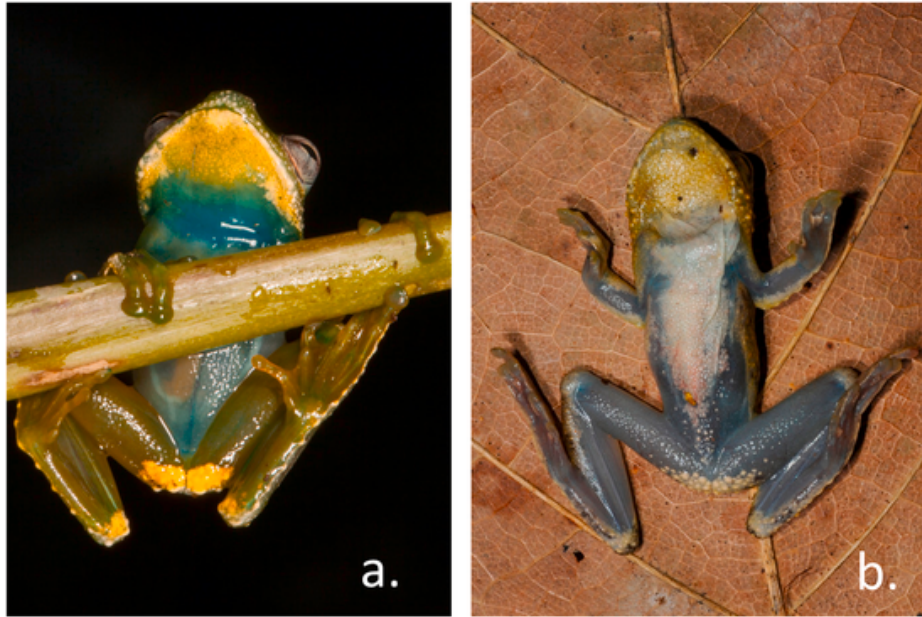
Fig. 2. Ventral coloration of live Alexteroon spp. males from Angola. a. Alexteroon obstetricans CHL 928 from Serra da Canda, Zaire province, b. Alexteroon hypsiphonus MTD 48923 from Serra do Pingano, Uíge province (right).

mens processed at MTD, reaching from tRNA-Phe to Cytb (Table 2). Only the assembled sequence data of the neotype of A. obstetricans (MNHNG 995.48) was of such poor quality that it had to be removed from subsequent analyses. However, the few fragments positively identified as endogenous DNA (nine fragments with a coverage between 3- and 16-fold and covering 380bp) were concordant with the sequence data assembled from the two modern A. obstetricans . Although, the amplified fragments for bait library construction theoretically covered the entire mt-genome, a ring closure, indicating a complete mitochondrial genome, could not be achieved.