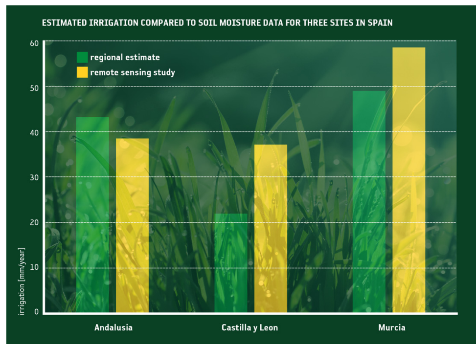
Figure 2. Comparison of observed (statistical survey) and estimated (through satellite soil moisture) annual irrigation volumes for three regions in Spain (adapted from Brocca et al. [97]).

The quantification of the amount of water used for irrigation is generally more challenging than mapping the extent of irrigated areas alone. The first study trying to estimate the irrigation water amount from satellite soil moisture data has been carried out by Brocca et al. [97], who quantified irrigation at 9 pilot sites in the USA, Europe, Africa, and Australia, with 4 satellite soil moisture products. This study demonstrated the feasibility of such methods for the quantification of irrigation water amounts, especially when using satellite observations with low retrieval errors (<0.04 m 3 /m 3 ) and short revisit times (<3 days). Good results were also found in regions with dry summers where the irrigation signal is more clearly pronounced (see Figure 2). The same approach was further applied by Jalilvand et al. [98], who obtained good agreement with ground-based irrigation data in a semi-arid region in Iran. Zhang et al. [99] qualitatively assessed the potential of various microwaved-based satellite soil moisture products for the detection of irrigation in China.