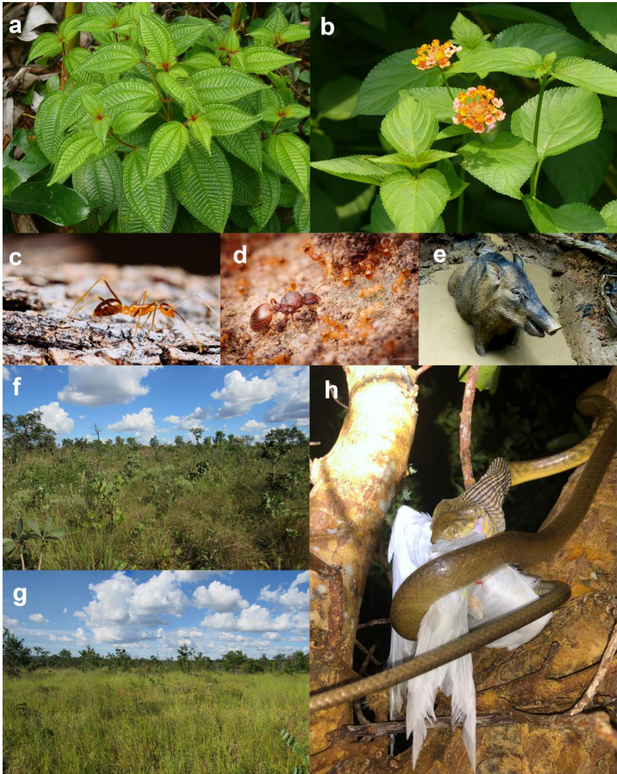
Figure 3. Examples of successful invaders in the tropics. (a) Miconia crenata and (b) Lantana camara have animal-dispersed fruits. Two invasive tropical ant species: (c) the yellow crazy ant, Anoplolepis gracilipes , and (d) the little fire ant, Wasmannia auropunctata , queen and workers. (e) A wild pig,