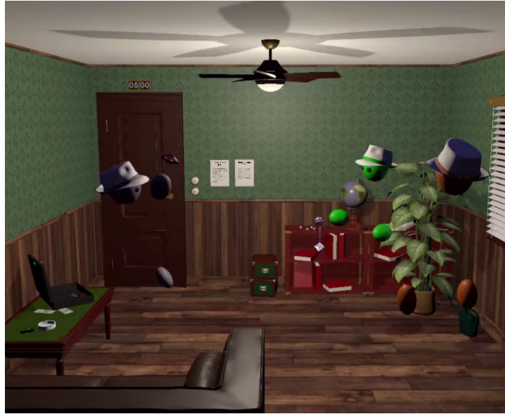
Fig. 2. Players collaborating in the Middle-earth escape room scenario.

catch the subtle nuances of human-human communication in several research domains, from psychology [8], neuroscience [12] and human computer interaction [3]. Figure 2 shows players in the escape room scenario.