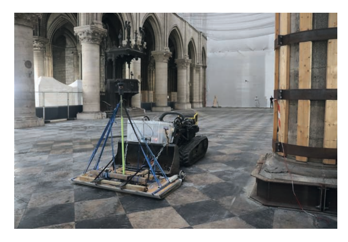
Figure 1. 3D-Radar survey with remote-controlled machine in the nave.

The different geophysical techniques revealed numerous anomalies (Fig. 3). This multi-device approach offered a global view of the cathedral's ground with a very good correlation. The various heating systems since the 19th century and onwards were found, as well as several sets of anomalies whose origin is undoubtedly related to the previous phases