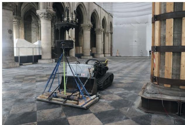
Figure 1. 3D-Radar survey with remote-controlled machine in the nave.

The different geophysical techniques revealed numerous anomalies (Fig. 3). This multi-device approach offered a global view of the cathedral's ground with a very good correlation. The various heating systems since the 19th century and onwards were found, as well as several sets of anomalies whose origin is undoubtedly related to the previous phases