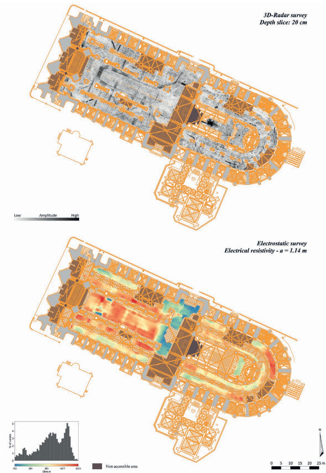
Figure 3. 3D-Radar and electrostatic maps (CAD: AGP/Inrap).