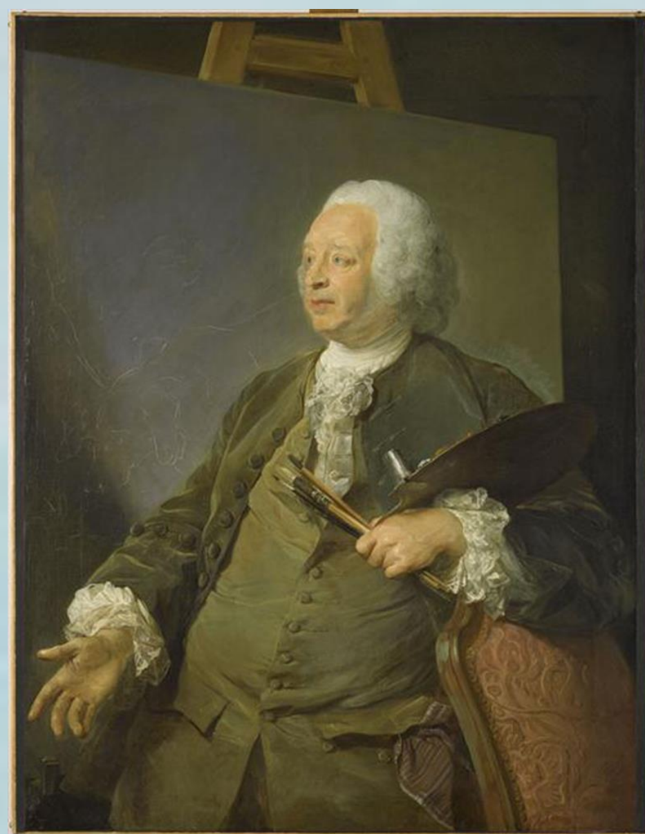
Perronneau Jean-Baptiste (1715-1783), Jean-Baptiste Oudry, Painter, oil on canvas, (105 x 131 cm) (inv7158), Paris, musée du Louvre

Jean-Baptiste Oudry is a French painter from the end of the 17 th century and the first half of the 18 th . Oudry is received at the French Academy of Painting and Sculpture in 1717. His painting production is estimated around more than one thousand paintings.