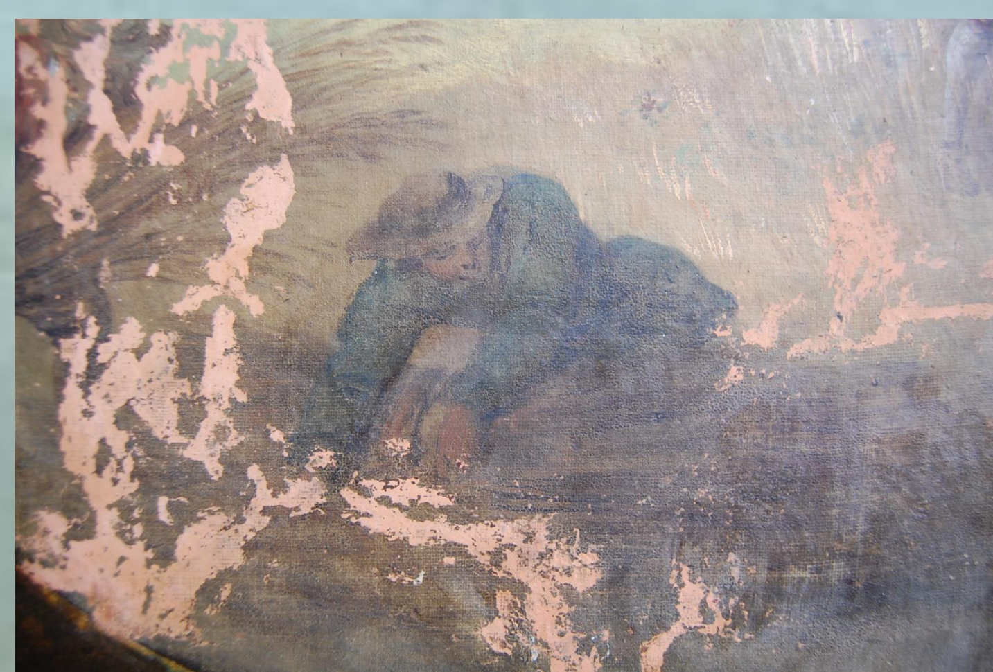
Summer, Detail Bottom left hand corner. Lacunas in burned, flattened paint layer.