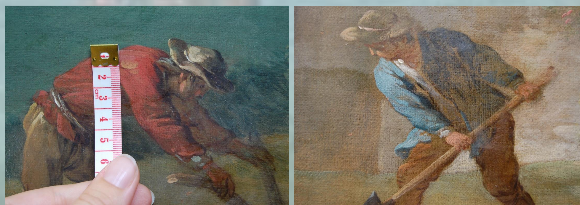
Spring, Detail of two characters. On the left, good preserved paint layer. On the right, blue layer abraded by previous conservation treatments. (C: C. Betelu)

PictOu facilitates the access to painting technology. The restoration documentation and the time of restoration are valorized. The painting condition description is presented as a preamble to technical information in order that visitors, students, art historians, curators, understand that the value and the scope of the information depends on it.