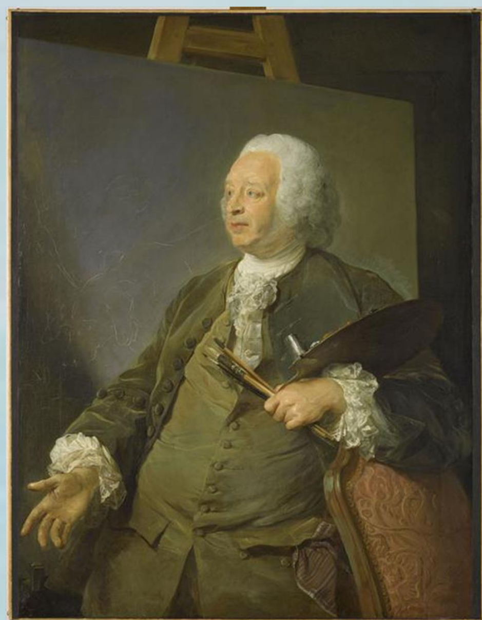
Perronneau Jean-Baptiste (1715-1783), Jean-Baptiste Oudry, Painter, oil on canvas, (105 x 131 cm) (inv7158), Paris, musée du Louvre

Jean-Baptiste Oudry is a French painter from the end of the 17 th century and the first half of the 18 th . Oudry is received at the French Academy of Painting and Sculpture in 1717. His painting production is estimated around more than one thousand paintings.