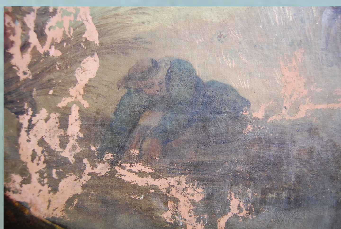
Summer, Detail Bottom left hand corner. Lacunas in burned, flattened paint layer. (C: C. Betelu)