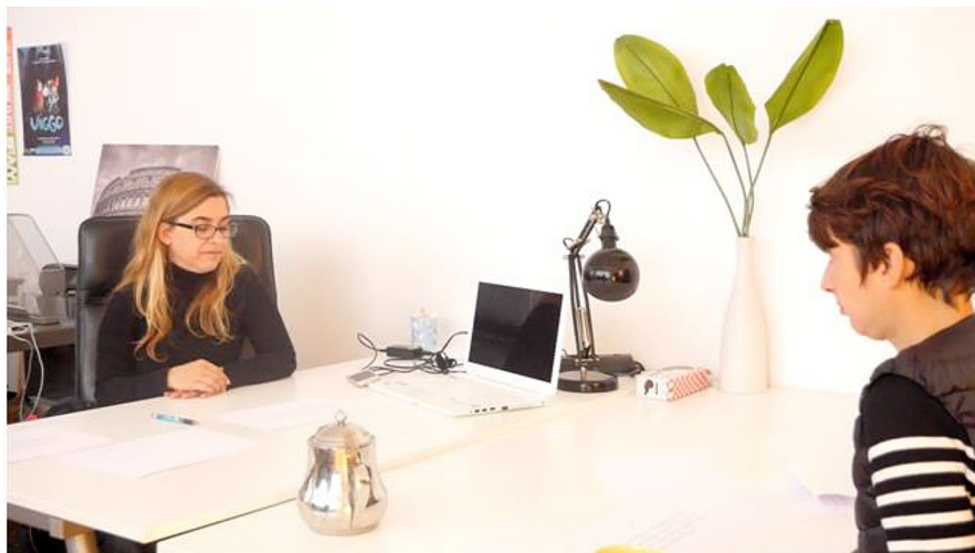
Fig. 1 A still of the set-up showing translators at work

kind, and allowed the participants to organize their work freely. Finally, the third and last session proposed three long texts (about half a page). The recordings took place over 5 days, and we collected a total of 16 h of footage, with one camera view on each translator's table and computer. When they were ready to deliver a translation, we filmed the result with the same cameras. They could split the performance in several takes, but no effort was put later in editing since the final result was not our focus.