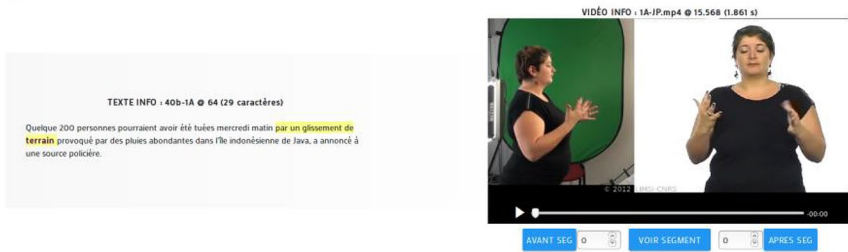
Fig. 6 A screenshot from the on-line concordancer