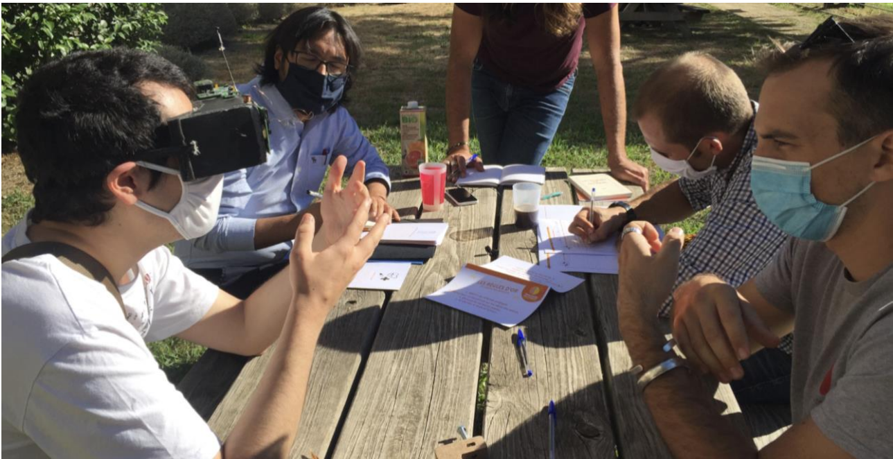
Figure 2: The forward-looking travel helmet experience to co-design the future.

Occitan region, in particular the Gard department, by projecting oneself into a possible future over 20 years away, “like an imaginary detour to then think differently about the present” (Abrassart et al., 2017). The purpose of the device designed for the workshop was to respond to scenarios of crises through design fiction. To do this, a forward-looking travel helmet was used in a dedicated workshop to help participants in this collaborative activity shortly project themselves into an unknown situation (Fig. 2). The participants, accompanied by a facilitator, could play four roles: traveller (who wears the helmet), shaman (who guides the trip), scribe (who takes note of the exchanges on a dedicated board) and journalist (who asks questions).