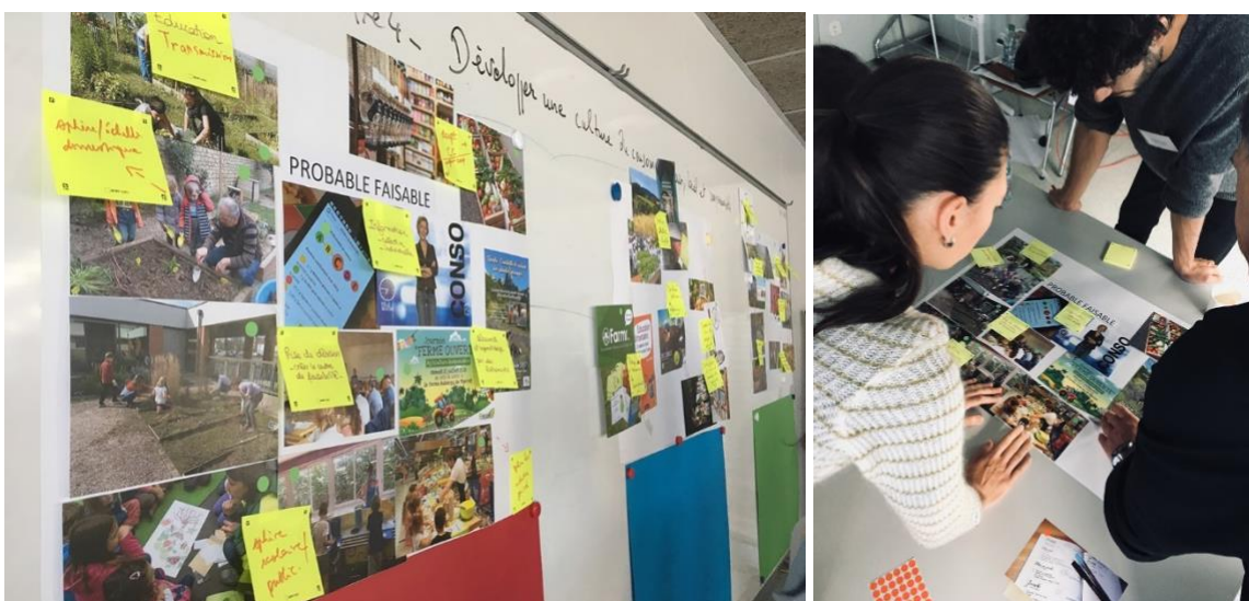
Figure 1: Frieze of territorial futures: Co-designing prospective scenarios in Clermont.