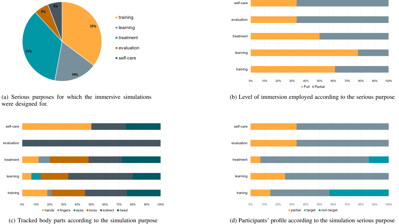
Fig. 2: Distribution of the immersive simulations according to its serious purpose, the VE level of immersion, the tracked users' body parts, and the experiment participants' profile.

used to help users to enhance their performance during the simulation (71% of the applications), and consequently, to improve the simulation outcomes. Certain simulations require someone to assist the user and analyze its results afterward, such as the treatment systems, in which a medical doctor receives the patient's log and analyze it to identify his/her progress. In this cases, the user does not always have a performance feedback during the simulation.