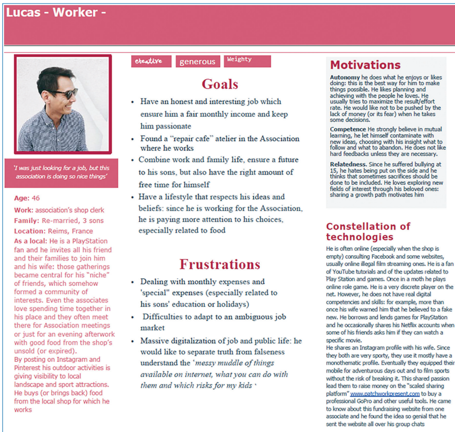
Figure 6.4. Persona worker.

it is possible and asks her bottle supplier for an out-of-order. Then, the product is sent to the shops as "reserved for Leo" while the payment already happened online, using the website as an intermediary.