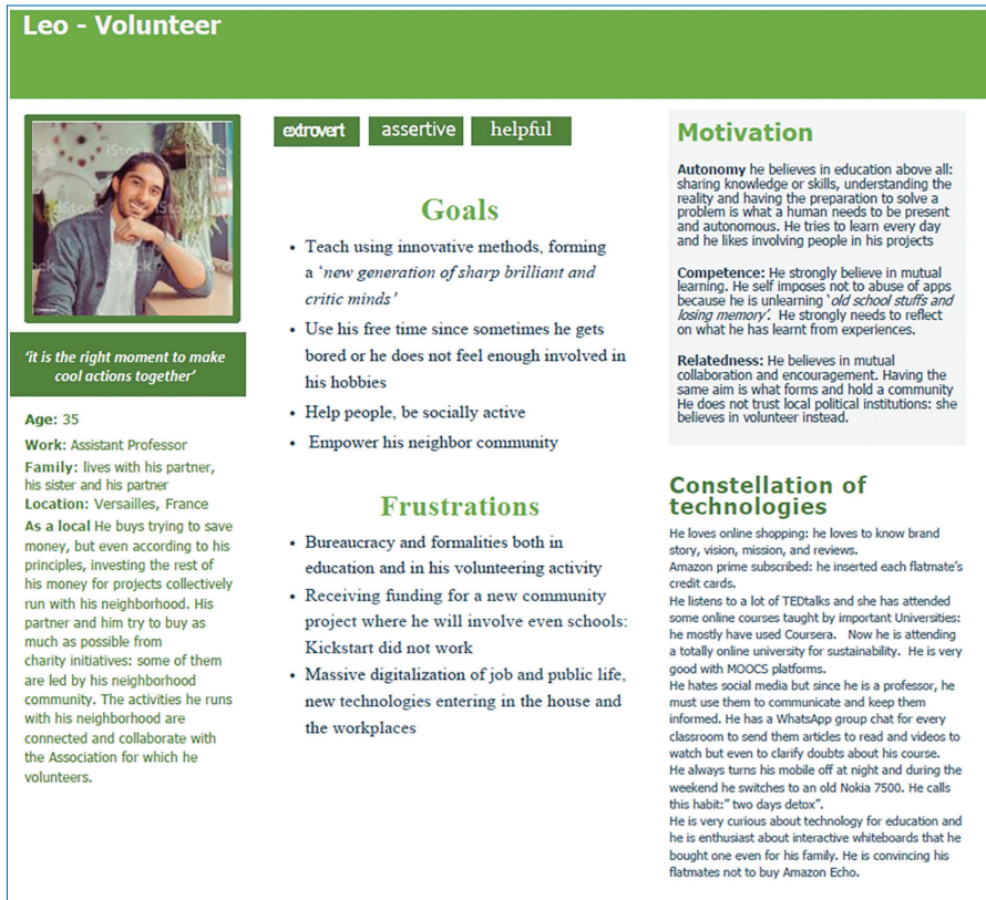
Figure 6.1. Persona volunteer.

the best way to fulfill all the listed aims consistently with one own values (in Ulisse and Cerf cases, environmental-related values).