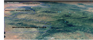
Map 2 and 3: The map of Kenya indicating the study area (on yellow spot); and GoogleEarth map image of Taita hills indicating three ICCAs

Ethnographic methods: participant observation and semi-structured interviews with validation of data conducted through fifteen-sessions of focus group discussions of between 6 to 10 respondents per session. Sample size=(n=246), data organized in themes/domains as described by CBD's Aichi Target 11 guidelines and explored whether the identified pastoral commons fit the criteria of ICCAs and OECMs. This included field visits to the common territories themselves and de visu landscape analysis