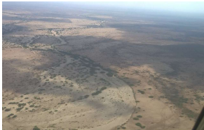
Map1: Map indicating our first area of study in 2016 among the Daasanach, Northern Kenya; Fig. 5: Aerial view of Daasanach riverine ecosystem which is protected by the community

In 2018, we moved to the opposite extreme of the country in South-East Kenya to explore the possible existence of new pastoral commons in the Taita hills, demonstrating again their important presence, and confirming our first and second hypotheses. In the subsequent section, we present our methods and results in our latest field of Taita that culminated to the conclusion that "Kenya is possibly home to numerous pastoral commons even if underrepresented scientifically, and could be potentially recognized as 'Other Effective area-based Conservation Measures' OECMs).