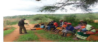
Figure 7 and 8: From left to right: Semi structured interviews; and Focus group discussion with the local community members