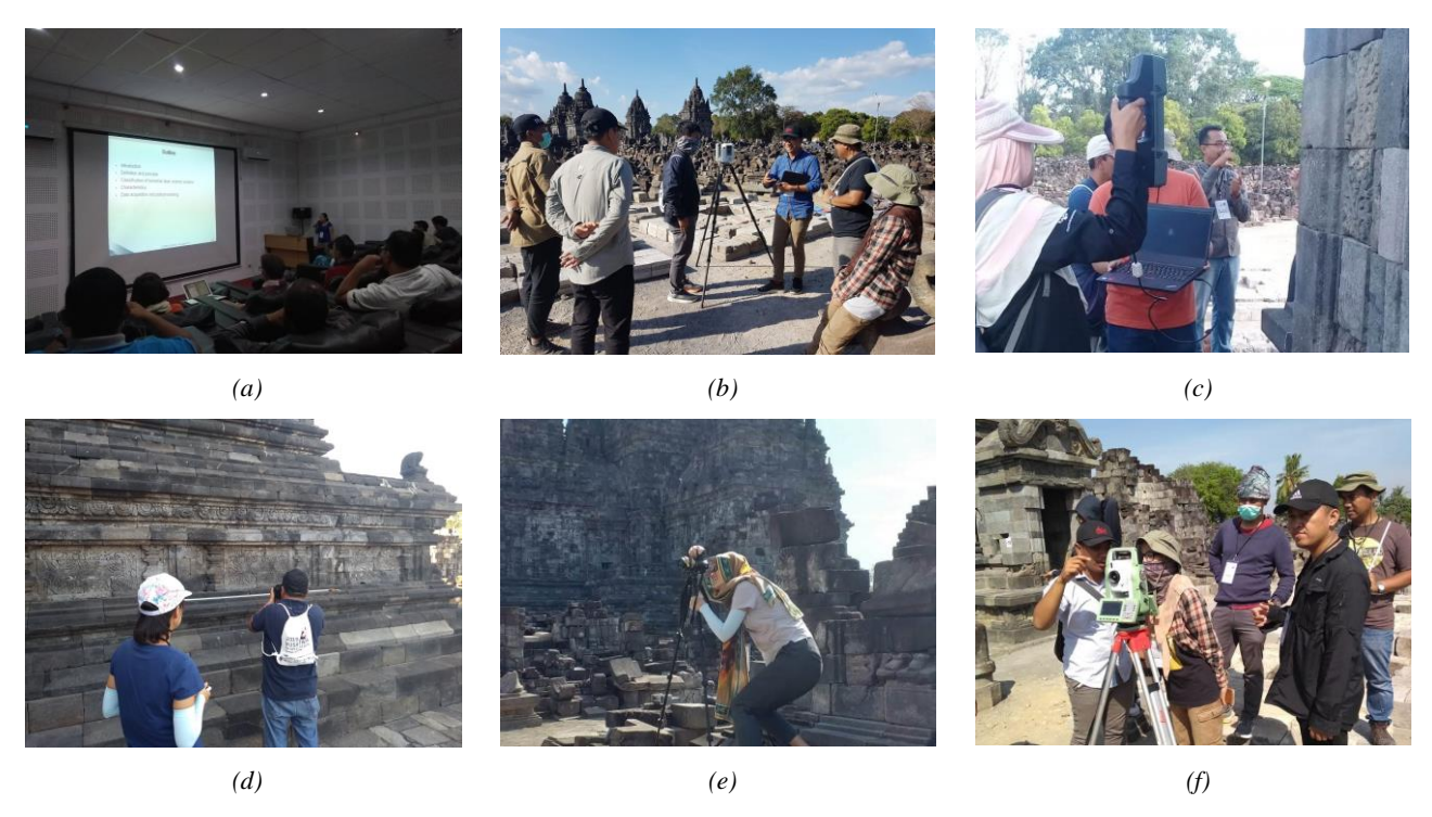
Figure 2. Documentation photos of the theoretical module (a) and the four practical modules: (b) terrestrial laser scanning, (c) handheld laser scanning, (d) close range photogrammetry, (e) terrestrial photogrammetry, and (f) surveying.