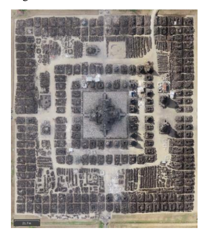
Figure 1. Orthophoto image of the Candi Sewu complex.

The initiative for the tropical school came from both Indonesian and French researchers to launch a workshop similar in format to previous CIPA summer schools for the Southeast Asian region. The aim of the tropical school was then a double pronged-one: an educational objective and a documentation objective. Through consultation with Indonesian partners, the site of Candi Sewu (Figure 1) was selected as an ideal candidate due to its strategic location.