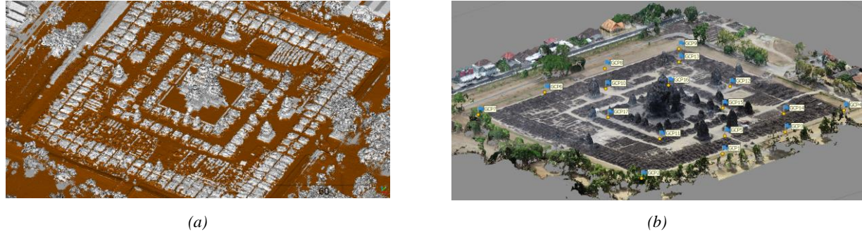
Figure 4. Some results of the documentation project and technical demonstrations: (a) lidar point cloud classified into ground and non-ground classes, (b) georeferenced drone photogrammetric point cloud.

The second outcome of the project was of a more technical nature. In addition to giving training to the participants, 3D documentation of the temple complex as a heritage site was also planned. Since this objective requires a stricter level of quality, this was mainly done using aerial drone photography and lidar. These acquisitions were not performed by the participants, but