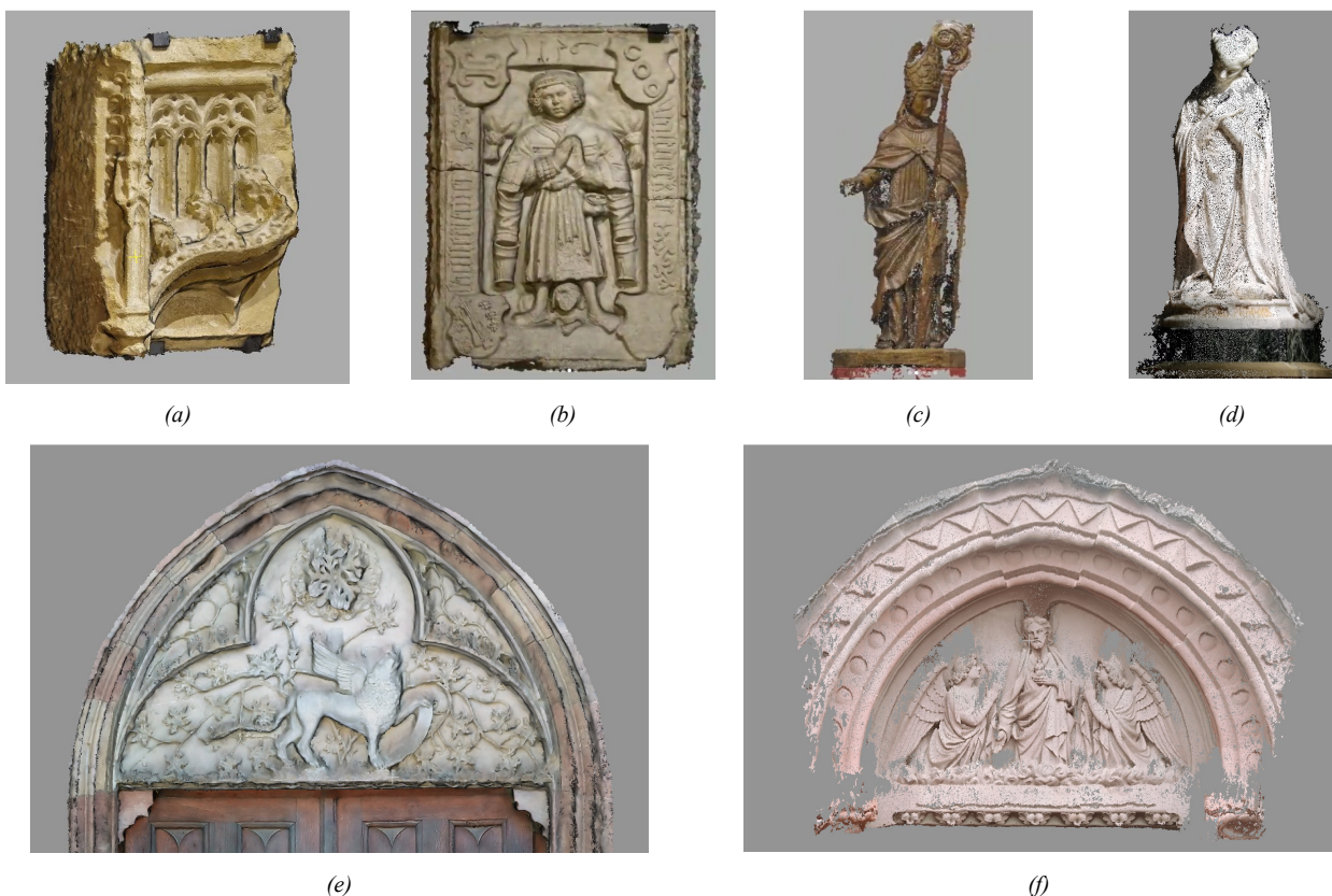
Figure 2. A selection of examples of 3D models generated by the smartphone videogrammetry technique. First row shows a trio of objects displayed in the Lëtzebuerg City Museum, Luxembourg: (a) Gothic relief, (b) medieval tombstone, (c) wooden statue of a bishop. (d) shows the marble statue of "Rosa Mystica" in the church of St-Pierre-le-Jeune in Strasbourg, France. Second row shows exterior cases: (e) tympanum of the church of St-Jean in Strasbourg France, and (f) tympanum of the church of St-Pierre-le-Jeune.

In Figure 2, several examples of 3D products are showcased both in the form of 3D point clouds and 3D mesh. All of these 3D models were generated from short videos ranging from 1 minute to 1 minute 10 seconds. They were shot by closely following photogrammetric requirements, i.e. covering the most of the object by trying to follow a convergent geometry.