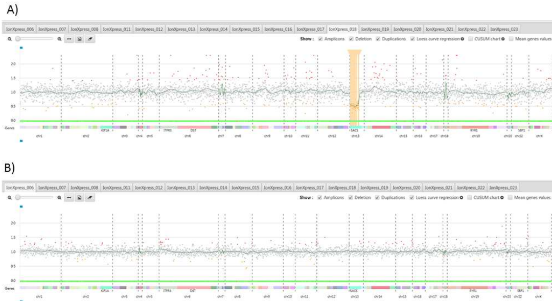
Figure 3: Detection of SACS Exon 10 deletion – A) Overview of CovCopCan table results, values around 0.5 (highlighted in yellow) show a deletion of this area in patient A (X-press 18), but not in the other patients tested in the same NGS Run; B) Alamut Overview of SACS gene and of the deleted area.