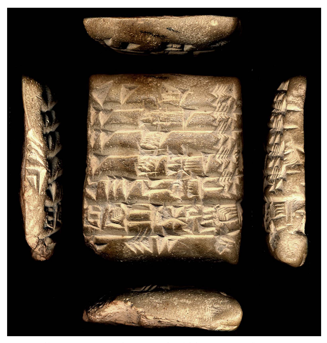
Figure 4. Tablet in Sumerian (Ur III) that mentions a fat-tailed sheep. Anonymous collection (CDLI P313095).

(Figure 1(b)). Iconographic depictions from this period often show a well-developed woolly coat (Figure 3) (Vila & Helmer 2014). Mesopotamian texts mention a diversity of sheep types of various origins as early as the third millennium BC (Figure 4), and later textual descriptions of wool quality and colour in the Near East and Aegean regions also confirm this diversity (Breniquet & Michel 2014). One hypothesis, therefore, is that woolly sheep breeds were favoured by urban development and the associated increasing demand for textile production.