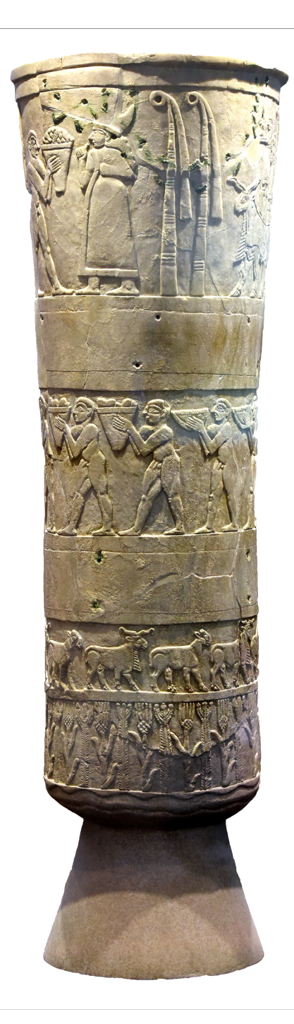
Figure 2. Uruk-Warka (Iraq), Uruk period. Lower register: row of sheep; rams with horizontal spiral horns and a mane (detail of Warka Vase, Iraq Museum); available at: https://commons.wikimedia.org/w/index.php?curid=78821078 (accessed 4 December 2020); CC BY-SA 4.0).