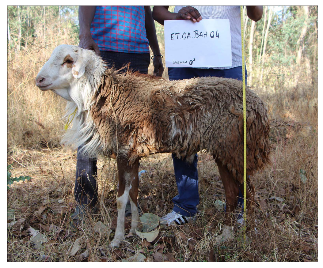
Figure 5. Washera breed, Ethiopia.