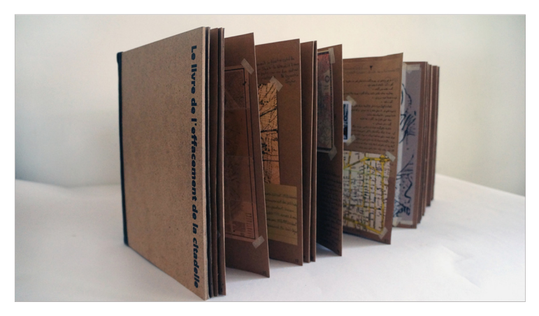
Figure 2. "Le livre de l'effacement de la citadelle", the author's project.