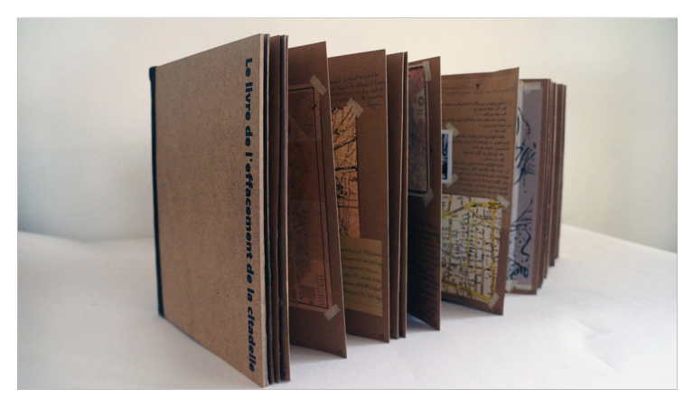
Figure 2. "Le livre de l'effacement de la citadelle", the author's project.