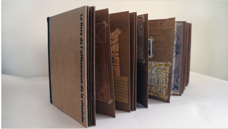
Figure 2. “Le livre de l’effacement de la citadelle”, the author’s project.