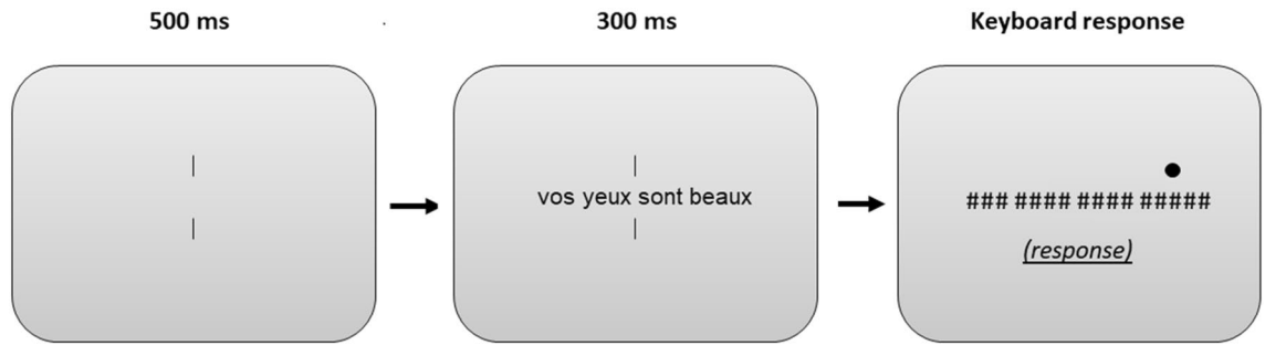
Figure 2. The post-cued partial report rapid parallel visual presentation procedure used in the present experiment. Participants had to type in the word they thought had been presented at the post-cued location, indicated by a filled circle.

location (i.e., the dot above the target location). Participants could type their response at this point, and their response appeared in a box located slightly below the string of hash marks. Once the return key was pressed, the next trial was displayed (Fig. 2). A practice session (16 trials) was administered before the main experiment to familiarize participants with the procedure. The 480 trials of the main experiment were presented in a random order. The experiment lasted approximately 25 min.