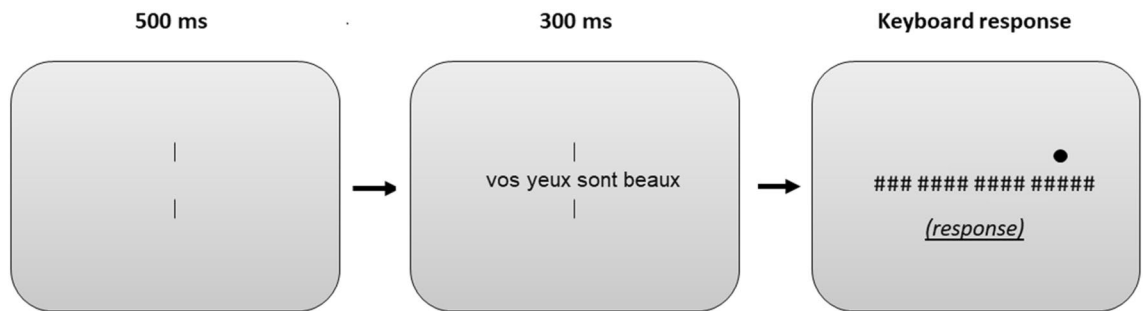
Figure 2. The post-cued partial report rapid parallel visual presentation procedure used in the present experiment. Participants had to type in the word they thought had been presented at the post-cued location, indicated by a filled circle.

location (i.e., the dot above the target location). Participants could type their response at this point, and their response appeared in a box located slightly below the string of hash marks. Once the return key was pressed, the next trial was displayed (Fig. 2). A practice session (16 trials) was administered before the main experiment to familiarize participants with the procedure. The 480 trials of the main experiment were presented in a random order. The experiment lasted approximately 25 min.