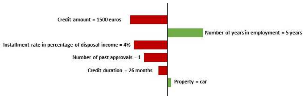
Weight of the variables in the refusal decision