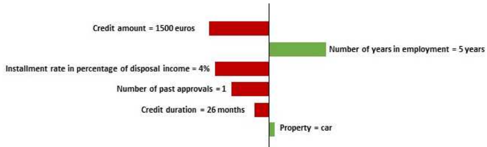
Figure 1: Variable importance (Shapley values) for 6 features involved in an AI model

credit amount variable contributes negatively to the approval of the credit application.