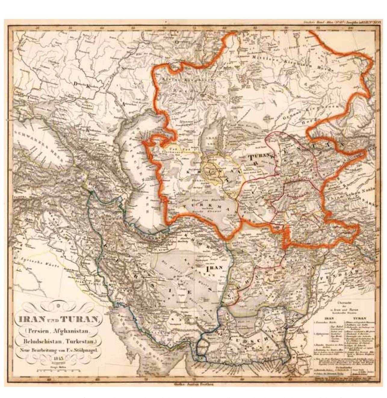
"Map of Iran and Turan" by Stieler, 1843. According to the legend (bottom right of the map), Turan encompasses regions including modern Uzbekistan, Kazakhstan and Northern parts of Afghanistan and Pakistan.