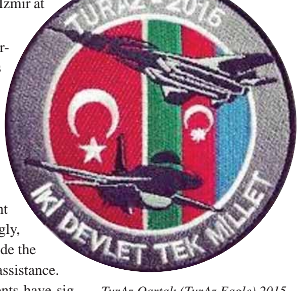
TurAz Qartalı (TurAz Eagle) 2015

eration between the two countries in the military-technical and security fileds. In this regard, it is worth mentioning the agreement on cooperation on military education, signed in 1992, although this has not been ratified for a long time. Under the agreement signed in October 2000, the parties agreed to continue the fight against terrorism and various types of crime. The supply of Turkish weapons and military equipment to Uzbekistan was discussed. Financial assistance was also provided to Kyrgyzstan, and in the autumn of 2000 the presidents of both countries decided to set up a joint group to work together on international terrorism.