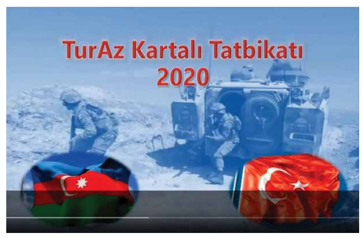
Türkiye Azerbaycan TurAz Kartalı Tatbikatı 2020 (" TurAz Eagle Exercise ": Turkish and Azeri joint military exercises established in 2015; youtube).

reassessment of Ankara's strategy in Central Asia. In 2009, Turkey was a strong force behind the Turkic Council. The organization was primarily aimed at promoting trade and investment between Member States. Turkish businesses have increasingly used this model of cooperation to make Turkey more attractive to foreign investors as a gateway to energy-rich Central Asian republics.