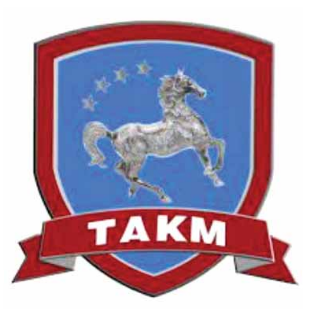
Emblem of TAKM (Avrasya Askerî Statülü Kolluk Kuvvetleri Teşkilatı), Organization of the Eurasian Law Enforcement Agencies with Military Status, i. e. Gendarmeries (Turkey, Azerbaijan, Kyrgyzstan and formerly, Mongolia).

As a result of the resurgence of the Nagorno-Karabakh conflict in the autumn of 2020, the idea of a higher level military cooperation was once again on the agenda. This military alliance is expected to be formed under the leadership of Turkey and, as the leading military power in the region, could become a determining factor in all regional and global issues.<sup>44</sup> Even in the