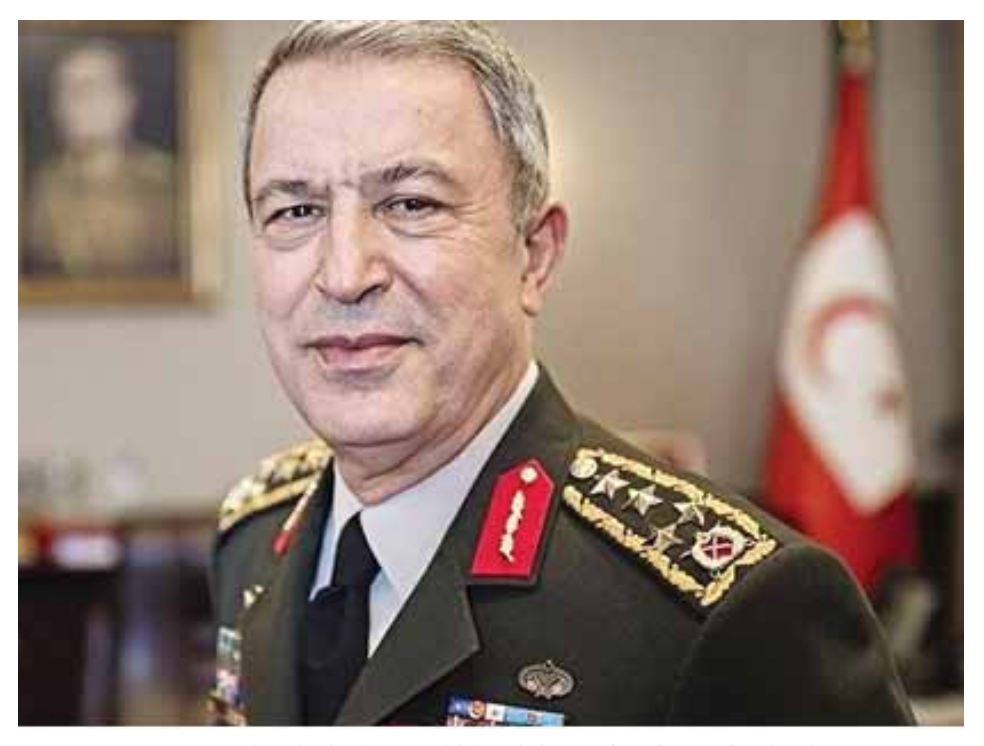
Orgeneral Hulusi Akar, Turkish Ministry of Defense (facebook)

er aspirations, which are reflected in significant strategic and military cooperation beyond economic relations. All this is important in order to get a clear and unambiguous picture of Turkey's strategic and defense foreign policy objectives for Central Asia and their results. However, the present analysis focuses primarily on strategic-defense relations and the geopolitical interests of the region and does not cover the details of the economic and cultural aspects of multidimensional relations.