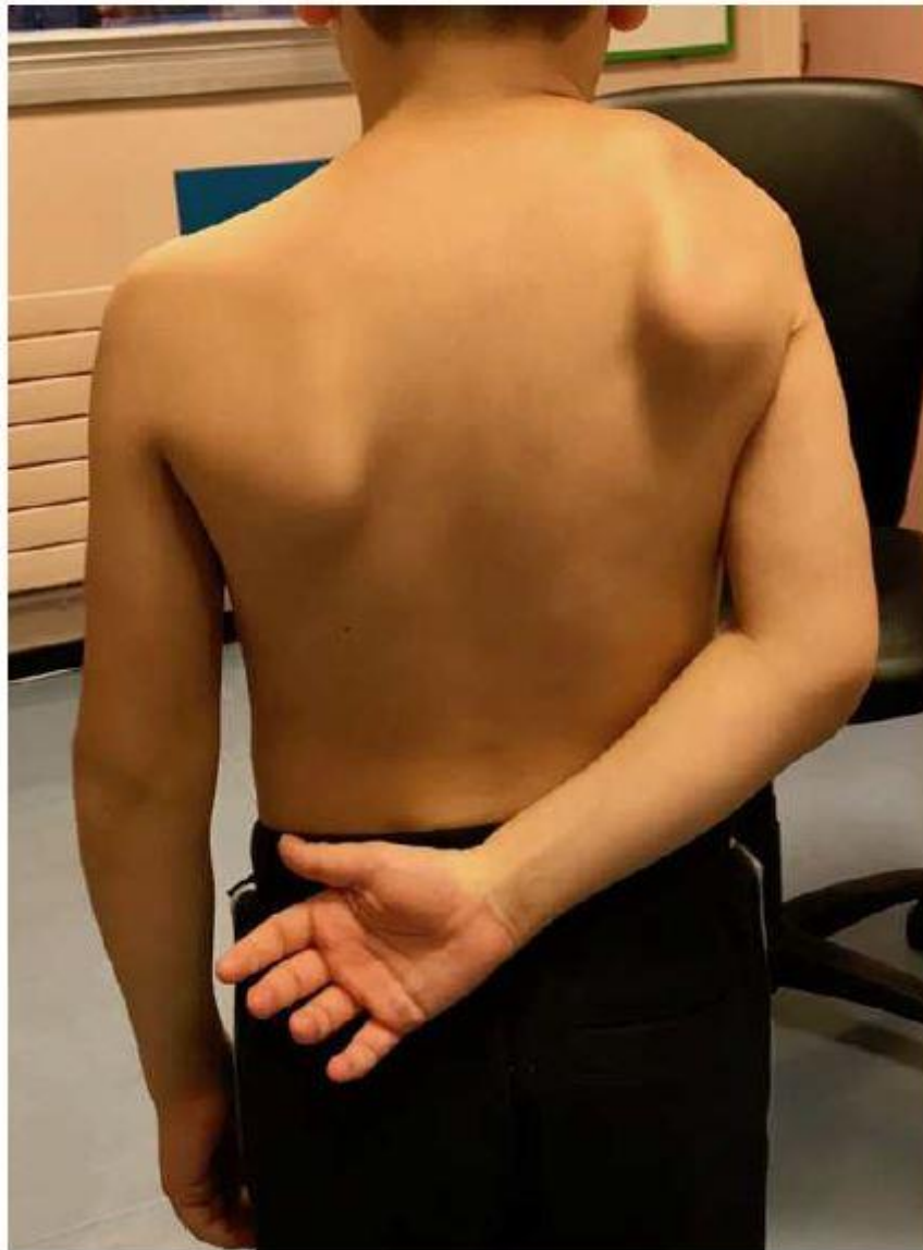
Fig.4 Winged scapula increased in internal rotation (patient 1).