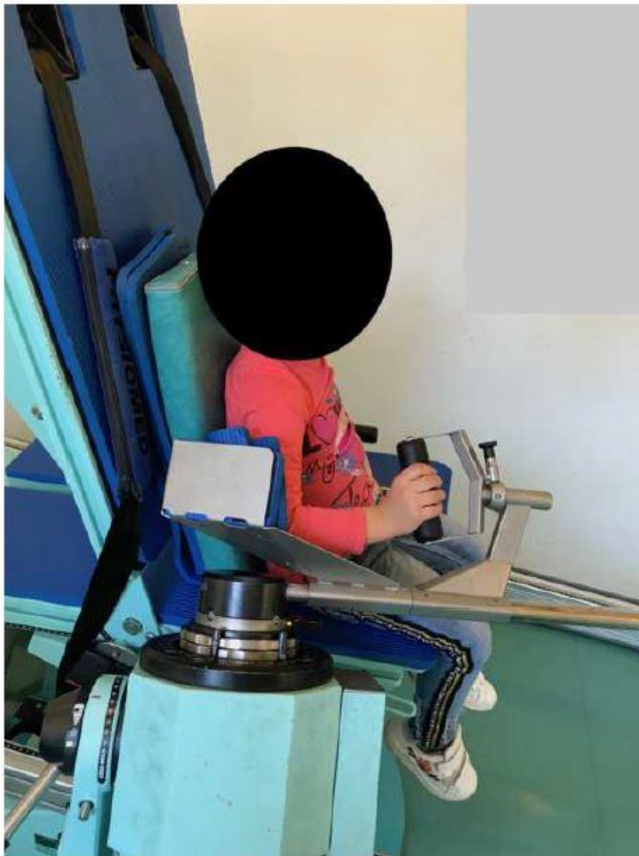
Fig.2 Strength testing of shoulder rotator muscles using an isokinetic dynamometer.