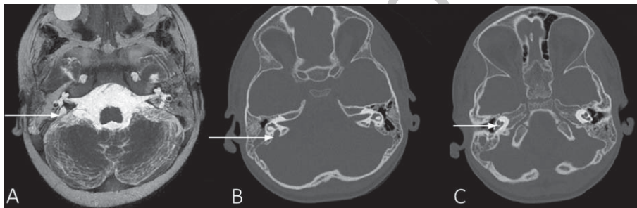
Fig. 2. CT-scan and MRI of hydrops in Pendred syndrome. Imagery of a patient with Pendred syndrome, with bilateral enlarged vestibular aqueduct (EVA), and cochlear incomplete partition type II (Mondini dysplasia). A: MRI T2 sequence, arrow shows the right EVA. B: CT-scan, arrow showing the right EVA with the large bony canal. C: CT-scan showing right Mondini dysplasia in the cochlea (only two turns).

endolymphatic hydrops concerning both cochlear and vestibular sectors (see Fig. 1), however saccular hydrops seems to be one of the most reproducible markers [3, 4, 39, 52, 57]. In PS/DFNB4, bilateral enlarged vestibular aqueduct (EVA), containing endolymph, is a constant feature in patients with biallelic mutations and may sometimes be associated with cochlear incomplete partition type II (Mondini dysplasia), as shown in Fig. 2. Both malformations can also be diagnosed on a CT-scan or MRI and are often indicators of PS/DFNB4 that usually precede genetic confirmation.