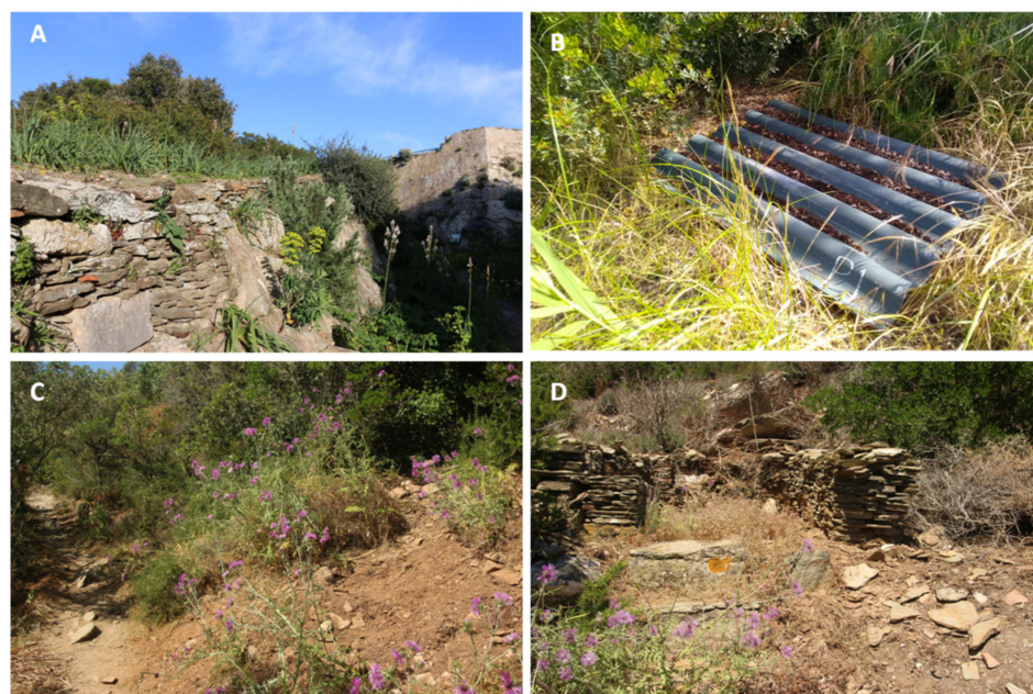
Figure 2. Sampling locations on Port-Cros before (A,B) and after wild boar outbreak in 2016 (C,D). Image (A) shows an intact dry stone wall. Image (B) shows corrugated fibrocement coverboard positioned along a hedge in a meadow. Image (C) shows rooting of the ground, leading to the disappearance of the herbaceous layer and of many shrubs. Image (D) shows the partial destruction of a stone wall. Overall a variety of habitat types was affected, we estimated that 60% to 80% of the whole area was plowed.