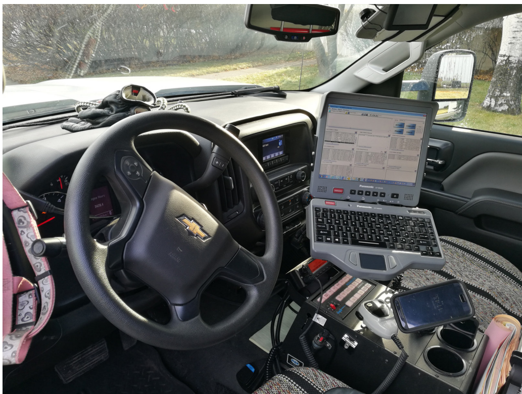
Figure 1: Picture of a bylaw officer's vehicle. Digital equipment (on-board computer, radio, smartphone) sits alongside “analogue” technologies (catch pole, gloves, leash, ticketing stubs).

down the protagonists involved in a dog-related complaints. In our fieldwork, city governments maintained two databases with information from different sources: (1) the licensing of dogs by their owners; and (2) incident reports produced by animal-control officers. Compliance with dog-licensing rules is therefore crucial for animal-control services to be effective and efficient. Here, not all cities are equal. As noted previously, we set out to compare animal-control investigations in the City of Calgary with the City of Edmonton because we wanted to understand what differences in licensing compliance mean, in practical terms, for dog-bite investigations. Of note, dog licensing has financial repercussions, since people typically pay a fee to license their dogs. Hence the higher the compliance with pet licensing, the more funding city governments obtain. In Calgary, for instance, licensing fees have sustained human-animal services ranging from outreach in schools about dog-bite prevention, to sheltering lost pets and returning them to their legal owners, to supporting volunteers to monitor off-leash parks (Rock 2013).