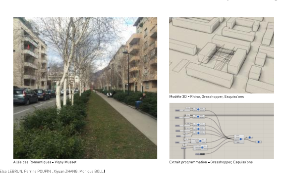
Figure 4. The location of the intervention scenario in Vigny-Musset with a Rhino and Grasshopper sketch.

The main idea of this project is to remove or open the gates and the grid surrounding the courtyard. This simple intervention changes the status of the courtyard as a private entity to a public space. This modification helps accommodating other usage patterns such as traversing, encounters, etc. The sonic sketch helped incorporating by sounds the increase in the degree of permeability between the interior ambience of the courtyard and the outer one of the street. The soundtrack permits to better understand the transformation in the sound environment of the courtyard (Figure 4).