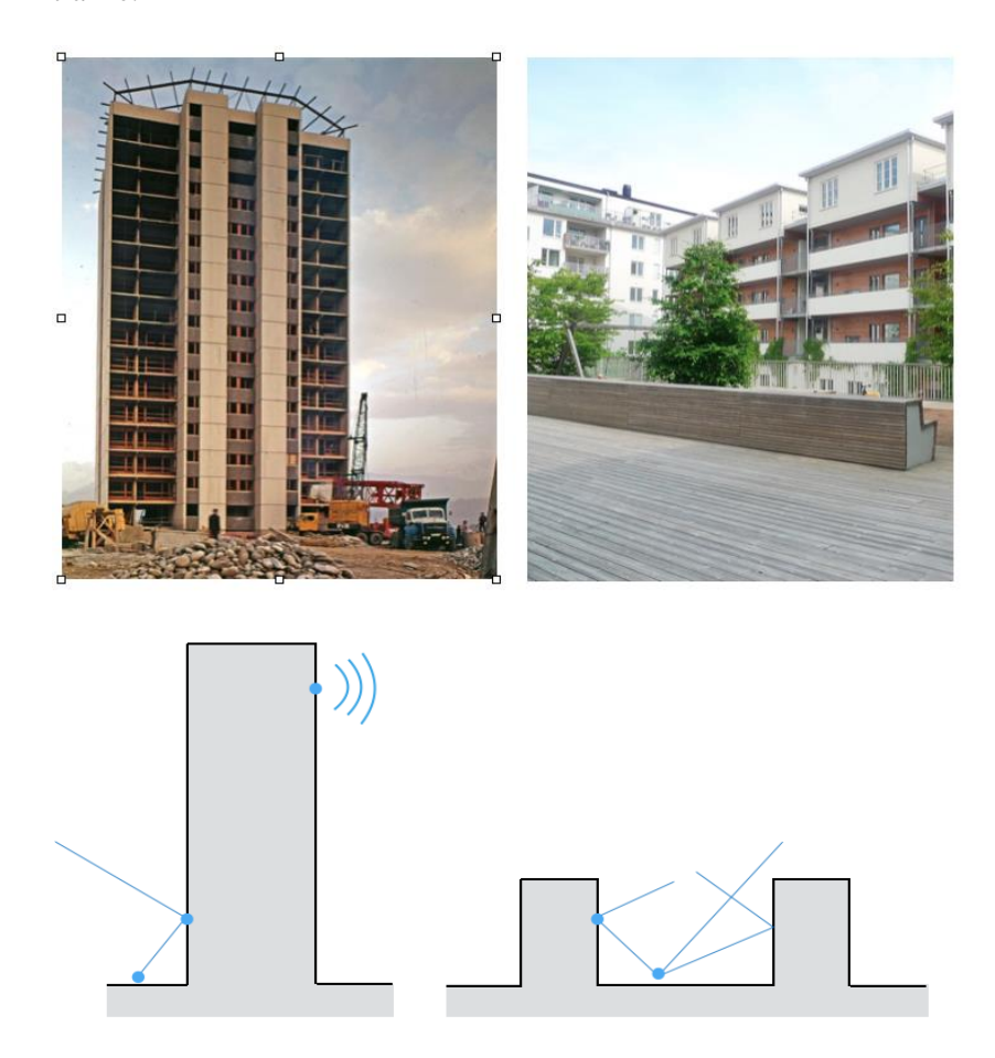
Figure. 1. The two urban fabrics: courtyards and towers and their acoustic behavior

Two districts in Grenoble, France, Village Olympique and Vigny Musset were chosen as case studies for conducting the sound diagnosis and modification (Figure 03). The urban configurations of the two districts are composed of pedestrian spaces which are qualified in terms of sound as impermeable in certain spaces and porous in others due to the presence of sound doors opening to the outside, or completely open, exposed to urban traffic.