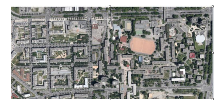
Figure 3. The urban form of Vigny-Musset to left composed of courtyards and Village Olympic to the right composed of linear pedestrian streets with residential towers.

Despite the contrast in urban and architectural forms of the two districts, their geographical juxtaposition has allowed participants to compare and articulate them by means of transversal listening. Two sound walks were conducted, one was free and silent during the day and the other was nocturnal and guided by Pascal Amphoux. These listening exercises have allowed participants to identify certain sono-architectural typologies and to distinguish the sound markers and the singularity of the soundscapes of both districts. Beyond a simple diagnosis, the main objective of this phase is to spot specific characteristics in order to steer prospective transformation.