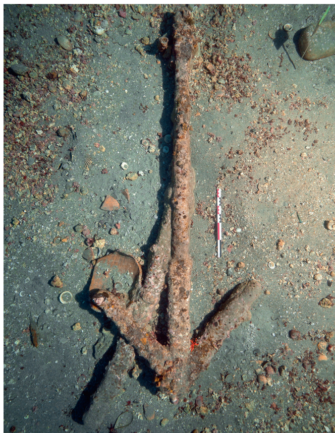
Fig. 3: Anchor A, the best preserved on the site.

Six frames are preserved in place, and a seventh (F102) has been moved. None of them are preserved on the top of the keel, thus it is impossible to determine if there were floor timbers.