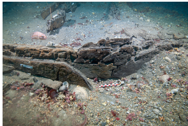
Fig. 4: The scarf between the keel (left) and the post (right): the garboard in the foreground.

The frames are 5.5 to 9 cm wide and 4 to 9 cm high. They are attached to the planking by treenails, sometimes reinforced by copper nails. F104 is attached to the planking by only one treenail. Nails are driven from outside the hull, and clenched on the top of the frames. Unlike the Kyrenia shipwreck (4 th century BC, Steffy 1985, p. 84), they are clenched only once, not twice. A few nails were discovered around the ship remains. The best preserved is 11 cm long and its head is 1.5 cm in diameter.