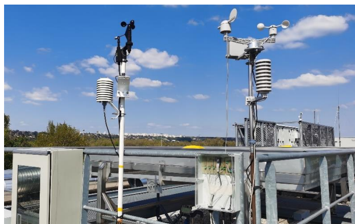
Figure 1. Reference traditional weather station on the left (from left to right and top to bottom): anemoscope, anemometer, pyranometer and air temperature and humidity sensor. Low-cost weather station on the right (from left to right and top to bottom): anemoscope, anemometer, rain gauge (at the back), pyranometer, and air temperature, humidity, and pressure sensor.

The experimental site is the green roof test bench GROOF installed on the roof of a building on the INSA Lyon campus in Villeurbanne. A traditional weather station is also installed on the same site as reference. Figure 1 shows the reference traditional weather station (left) and the low-cost weather station (right) with one of the platforms in the background which will be equipped with a green roof.