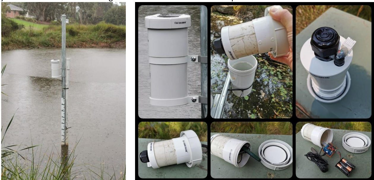
Figure 1. System installed on the field (on the left of the pole) and photos of the encapsulation system made for easy fixing and removal without changing the location of the sensor.

The system is encapsulated in a 100 mm pipe in order to provide a cheap water-proof case and make it less noticeable, with the aim of reducing the risk of vandalism. The enclosure also allows easy removal/replacement without changing its location. Figure 1 presents the system deployed on site. The system runs on three AA rechargeable batteries and a 0.5 W solar panel.