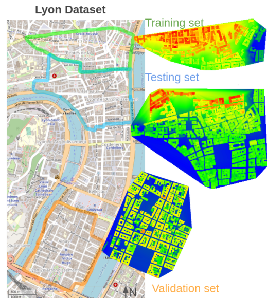
Fig. 2. Lyon dataset split into 3 distinct parts: West and North are used for training and validation for DL and ML methods, South is always the testing set. Height is shown in color.

We can observe that among methods that process directly 3D PCs, best results are achieved with RF [8], that however requires some level of supervision and the prior extraction of