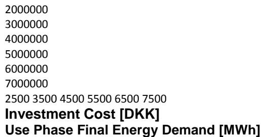
Fig. 5 Comparison of bi-dimensional Pareto fronts from 5 multi-objective algorithms used in [15] relating use phase final energy demand against investment cost

Table 2 Comparison of 5 multi-objective algorithms used in [15] according to the number of alternatives set for the optimization and the resulting number of feasible and optimal solutions Alternatives Feasible solutions