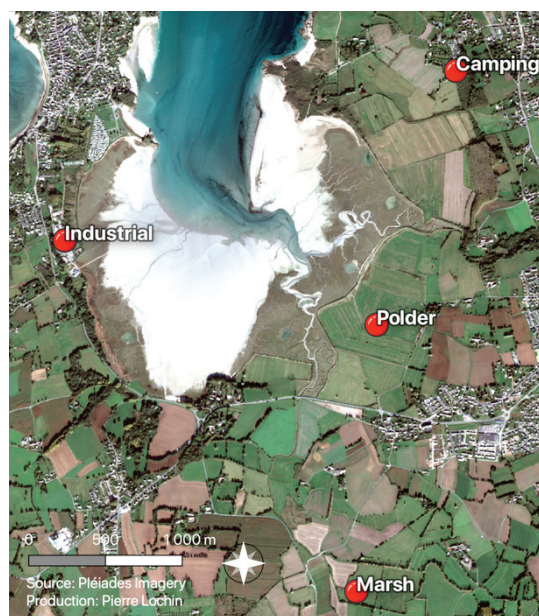
Figure 1. Location of water height measurement sites on the Bay of Beaussais

Our study site focuses on the Bay of Beaussais and its associated watershed, which are located on the northwest coast of France in Brittany (Figure 1). This region is characterized by a temperate climate under a significant oceanic influence occasionally leading to severe storms, especially in winter. The main specificity of this area is its exceptional tidal range, which can reach up to 13 meters.