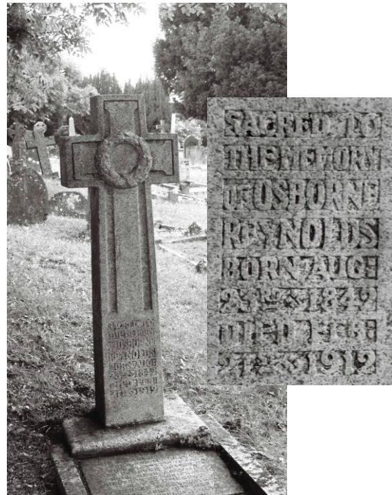
Figure 10: Osborne Reynolds' gravestone in St Decuman's churchyard.