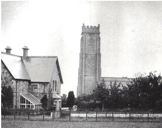
Figure 9: St Decuman's vicarage c.1900 where Reynolds spent his final years (from Wedlake [17]).

His final years in Manchester were marked by his intense efforts to provide a mechanical theory of matter and the ether which culminated in his work The sub-Mechanics of the Universe being reported orally at the Royal Society in 1902 and published as Volume 3 of his collected works [16]. As Lamb's [1] obituary notes, however, in what must be seen as a kind understatement, “ unfortunately illness had begun gravely to impair his powers of expression and the memoir as it stands is affected with omissions and discontinuities which make it unusually difficult to follow ”. Gibson [2] has noted that 1903 was the last year in which Reynolds was able to take an active role in the department, his declining mental state (a condition that today might have been diagnosed as Alzheimer's) leading to his retirement from the University at the age of 63 in 1905.