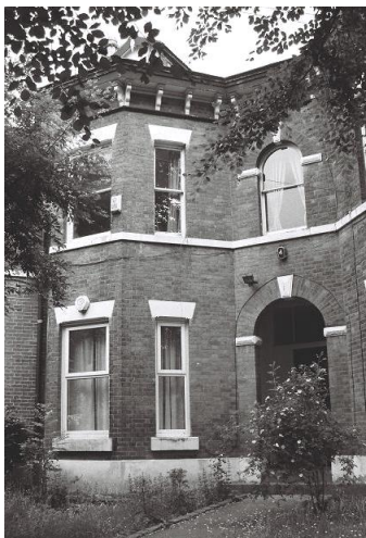
Figure 4: The Reynolds' family home at 23, Lady Barn Road, Fallowfield.