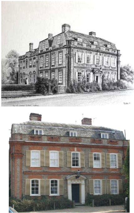
Figure 1: The Old Schoolhouse, Dedham (a) in Reynolds' time (b) today