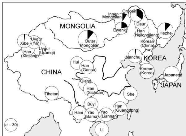
Figure 3 Geographical distribution of Manchu cluster chromosomes. Circles, Populations sampled, with area proportional to sample size. Filled sectors, Manchu clusters.

maintained many concubines. A central part of the Qing social system was the army, the Eight Banners, which was made up of separate Manchu, Mongolian, and Chinese (Han) Eight Banners. The nobility occupied high ranks in the Manchu Eight Banners but not in the Mongolian or Chinese Eight Banners; the Manchu Eight Banners were recruited from the Manchu, Mongolian, Daur, Oroqen, Ewenki, Xibe, and a few other populations. A social mechanism was thus established that would have led to the increase of the specific Y lineage carried by Giocangga and Nurhaci and to its spread into a limited number of populations. We suggest that this lineage was the Manchu lineage.