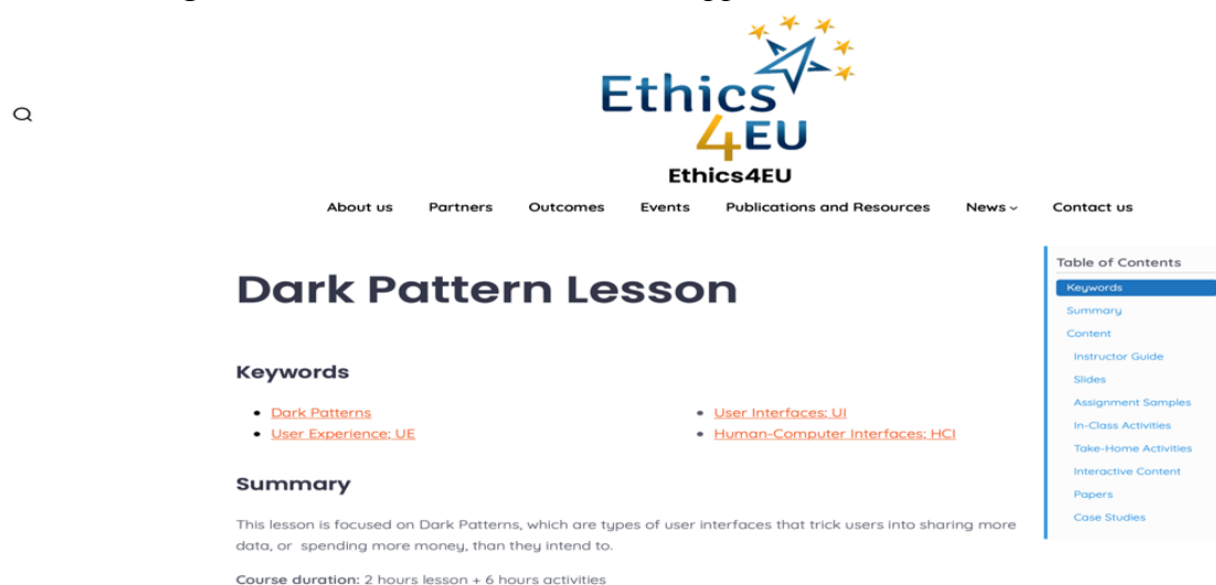
Figure 1. The ETHICS4EU Teacher Support Service Front-End