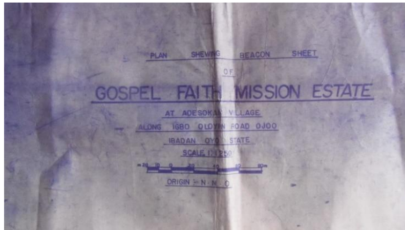
Title section of the survey plan of 1983

The huge piece of land which is between 30 and 35 acres was purchased in pieces from various villages that made up the area at the time.