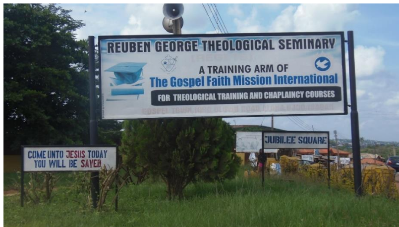
Large billboards depicting GOFAMINT and adjoining regions as 'Gospel Town'

The population of the mission members and enthusiasts of GOFAMINT has notably increased. The permeability of the camp's boundaries has also allowed a blend of housing and land use for residential purposes. The close and permeable interaction of the nearby residents have evolved a new nomenclature of the place. The place largely known as Alàkà is now generally called Gospel town. This does not seem to go down with a much more orthodox group of residents near the camp as they fear the new name will erode the historical identity of Alàkà. They have since frowned at billboards put up by GOFAMINT (see picture below) and other people that state the address of the area as 'Gospel Town'. This tension is in a gradient as it disappears as one moves through the camp to the immediate adjoining residents behind (up north) who really do not care (in fact they form part of the people who came up with the name). This occurrence shows how the presence of religious practices in large communities influence even the nomenclature of their urban transcript. It is however not clear in the case of GOFAMINT if the permeability of the camp contributed to the tension of the area nomenclature. All our respondents within the camp and outside it explain that the permeability played some role. Nonetheless, they credit the increase in population of the people who engage the camp during large events as a more probable cause of 'enforcing' the popularity of the place as 'Gospel Town'.