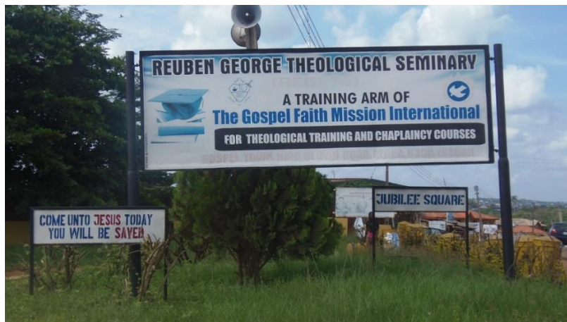
Large billboards depicting GOFAMINT and adjoining regions as 'Gospel Town'

The population of the mission members and enthusiasts of GOFAMINT has notably increased. The permeability of the camp's boundaries has also allowed a blend of housing and land use for residential purposes. The close and permeable interaction of the nearby residents have evolved a new nomenclature of the place. The place largely known as Alàkà is now generally called Gospel town. This does not seem to go down with a much more orthodox group of residents near the camp as they fear the new name will erode the historical identity of Alàkà. They have since frowned at billboards put up by GOFAMINT (see picture below) and other people that state the address of the area as 'Gospel Town'. This tension is in a gradient as it disappears as one moves through the camp to the immediate adjoining residents behind (up north) who really do not care (in fact they form part of the people who came up with the name). This occurrence shows how the presence of religious practices in large communities influence even the nomenclature of their urban transcript. It is however not clear in the case of GOFAMINT if the permeability of the camp contributed to the tension of the area nomenclature. All our respondents within the camp and outside it explain that the permeability played some role. Nonetheless, they credit the increase in population of the people who engage the camp during large events as a more probable cause of 'enforcing' the popularity of the place as 'Gospel Town'.