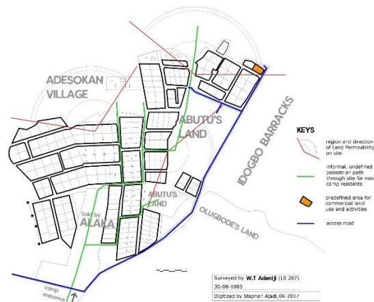
Survey plan of GOFAMINT, showing characters of permeability

come for retreat. We rent our halls for burial and wedding ceremonies.”