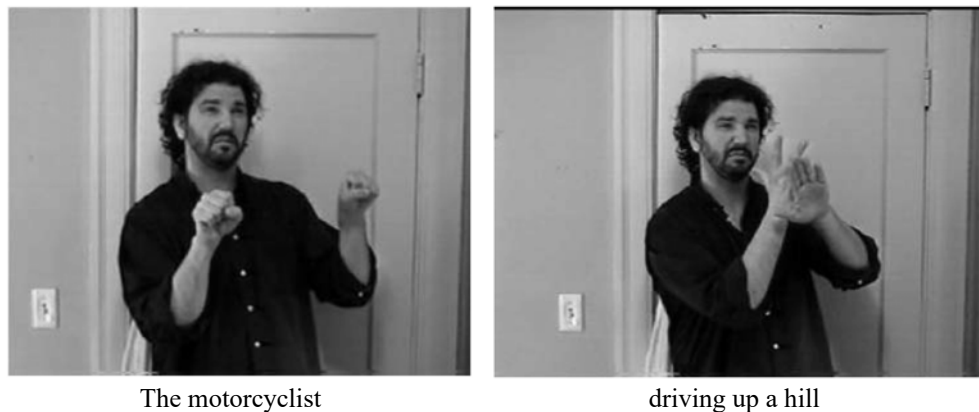
Figure 1. Classifier usage (Dudis, 2004).

can be used to describe the size and shape of an object, and they can also represent how an object moves or is utilized. Through the use of classifiers, a signer can describe a scenario with few discrete lexical items. The signer creates an image in space. This is not simply an informal gesture as there are well-documented linguistic rules governing classifier usage (Lepic & Occhino, 2018). These are evocative, not necessarily iconic, and are extremely powerful. In a story about a motorcycle ride (Dudis, 2004), a signer can use an instrument classifier to indicate that the rider is revving the engine and a vehicle classifier to show the rider driving away on a hilly highway (Figure 1).