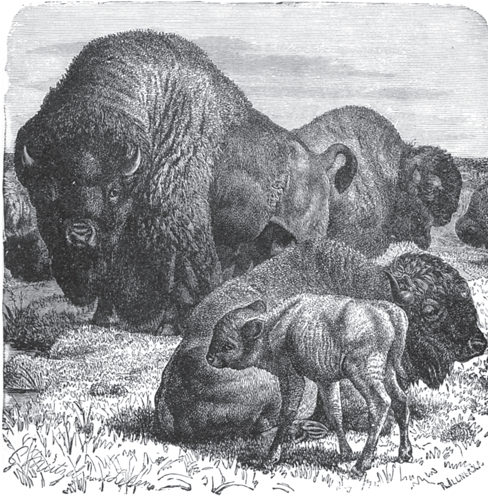
“The illustrations of the peccary and American bison are examples of the wood cuts, a large proportion of which are borrowed from Brehm’s Thierleben .” Figured: “The American Bison.” From the review of the Standard Natural History ( The American Naturalist , 1884, 18:808–809).