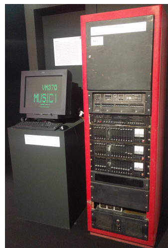
(b) TAUmus on exhibit.