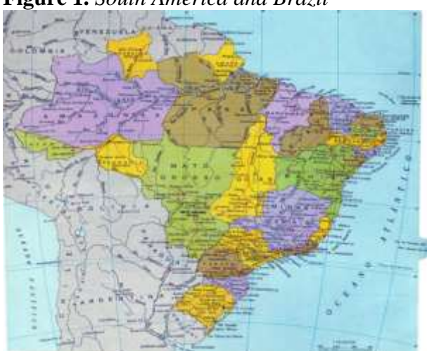
Figure 1. South America and Brazil

The crises of the cocoa monoculture begin in the 1990s with the growth of regional unemployment, a considerable decrease of the cocoa production in the south of Bahia, becoming Brazil a cocoa importer with the productive disruption of the agricultural systems based on the cabruca cocoa plantations, increasing, an intensive way, the deforestation of the Mata Atlântica (tropical forest) and agriculture being replaced by the cattle breeding system.