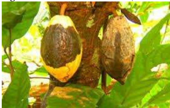
Figure 8. Witch's Broom Disease (Vassoura-de-Bruxa)