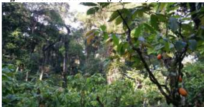
Figure 6. Cocoa Cabruca Agroforestry System