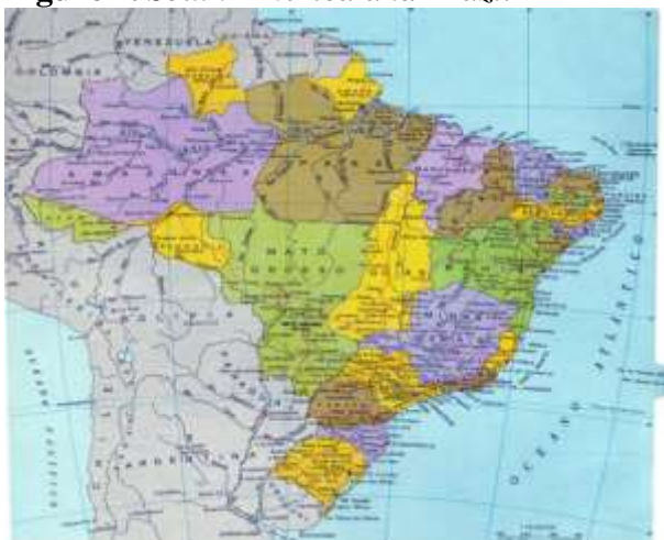
Figure 1. South America and Brazil

Historically, although the existence of the cabruca system, the cocoa production systems was increased with an intensive technological package with chemical intrants, expanded by the Special Commission for the Cocoa Plantation (CEPLAC - Comissão Especial para a Lavoura Cacaueira ), since