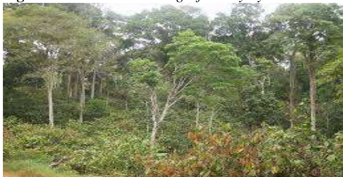
Figure 7. Cocoa Cabruca Agroforestry System