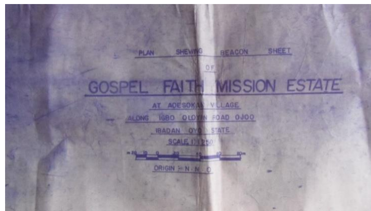
Plate 01: Title section of the survey plan of 1983 (Ajadi, 2017)

as for government, we do not face any stringent regulation regarding land acquisition. We have always been able to meet the legal requirements of obtaining land. The only regulation we found stringent was that of the tenure of general overseers of churches that affected the general overseer of the Redeemed Christian Church of God. But the government has called back this code and has since regretted its action.