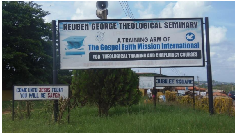
Plate 04: Large billboards depicting GOFAMINT and adjoining regions as ‘Gospel Town’ (Ajadi, 2017)

The GOFAMINT’s style of public space appropriation is, to a reasonable extent, different and less sophisticated than that of the RCCG as documented by Adeboye (2012). In addition to blocking road for other users due to traffic gridlock caused by congregants’ vehicles, RCCG conduct church services in cinemas, clubs, hotels, among other public spaces.