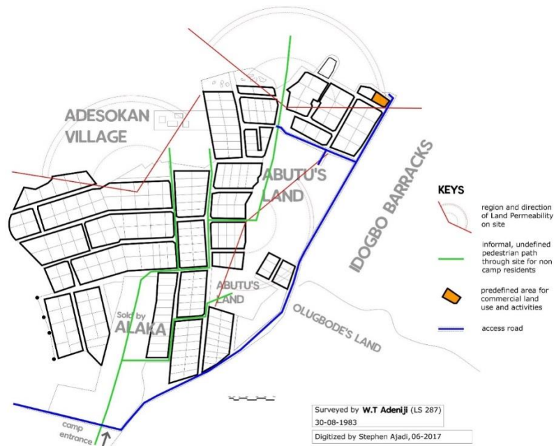
Figure 02: Digitized survey plan of GOFAMINT, showing characters of permeability

However, the seeming openness of certain sides of the camp has some soft demarcations to control vehicles (see plate 03). These demarcations are usually left open during the day but are under close watch at night. They control only vehicles as pedestrians can seep through the rather wide interstitial spaces between (and through) the barricades. Consequently, passers-by ‘intrude’ into the camp’s premises. Though the camp does not bar them from passing, the security men and a pastor complained that some of these passers-by are indecently dressed, which suggests to them that they do not recognise the sanctity or sacredness of the camp.