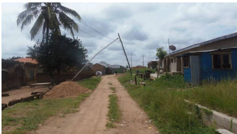
Plate 03: soft space demarcation at the northern periphery of the camp (Ajadi, 2017)

However, the seeming openness of certain sides of the camp has some soft demarcations to control vehicles (see plate 03). These demarcations are usually left open during the day but are under close watch at night. They control only vehicles as pedestrians can seep through the rather wide interstitial spaces between (and through) the barricades. Consequently, passers-by ‘intrude’ into the camp’s premises. Though the camp does not bar them from passing, the security men and a pastor complained that some of these passers-by are indecently dressed, which suggests to them that they do not recognise the sanctity or sacredness of the camp.