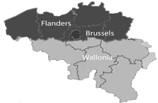
Map 1: The regions of Belgium used in the study