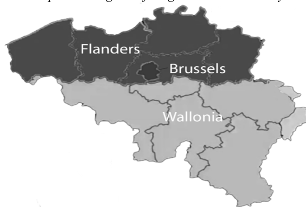
Map 1: The regions of Belgium used in the study